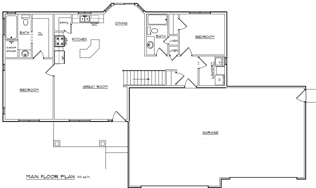
MAIN FLOOR PLAN 1212 sq.ft.