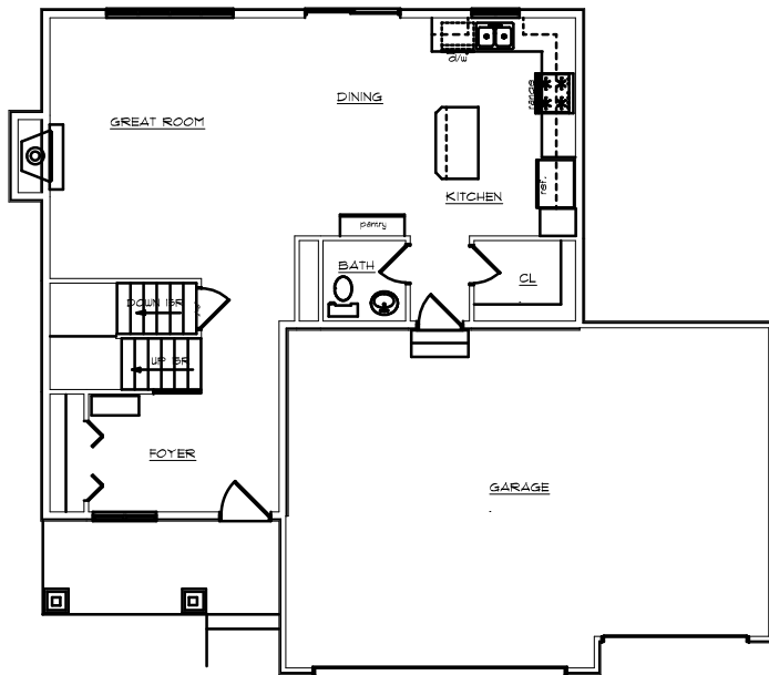
MAIN FLOOR PLAN 848 sq.ft.