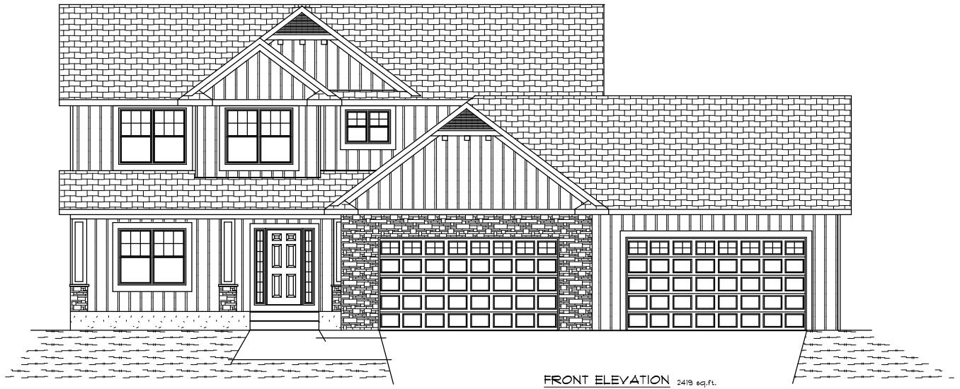
FRONT ELEVATION 2419 sq.ft.